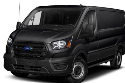
Ford Transit Cargo Van