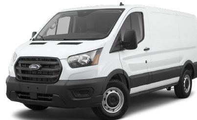
Ford Transit Cargo Van